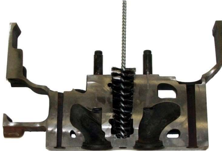
Cleaning Brush after Sleeve Removal