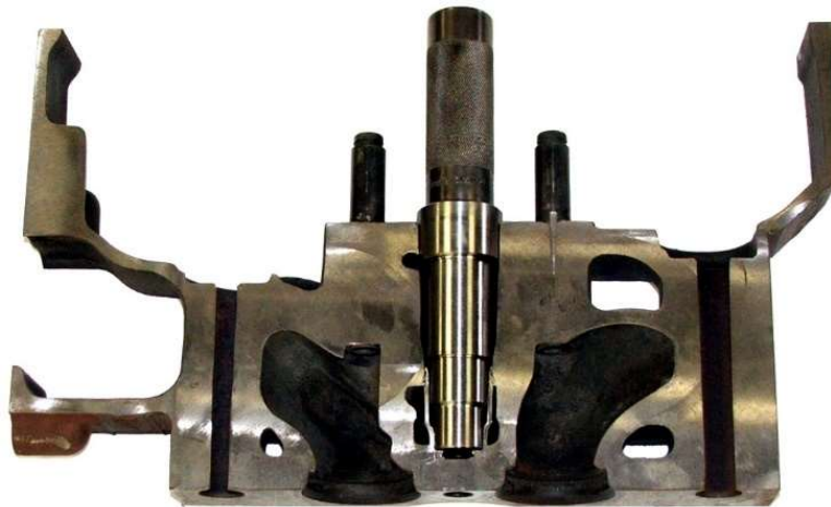
Sleeve Drive-In Tool inserting new Sleeve