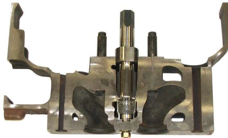
Tap with Bushing & Injector Tube Hold Down Assembly